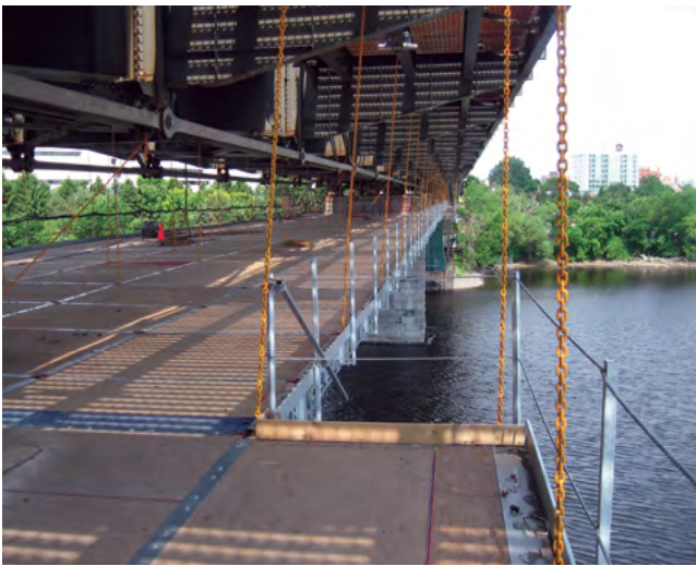
► QuikDeck provides safe and spacious work platforms for new constructions, refurbishment and repair work