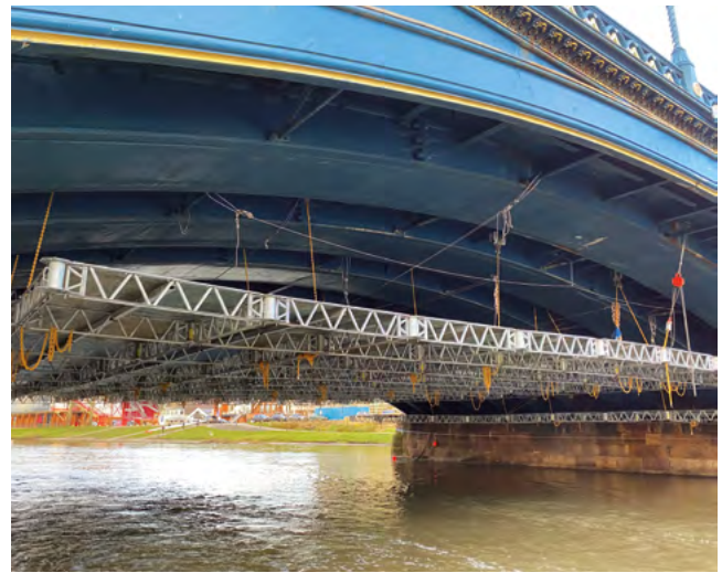
► Trent River Bridge (UK): QuikDeck provides large safety margins thanks to high load capacity of the suspension chains